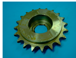
SPROCKET OD \varnothing 108 (N=25) HITACHI V-EN