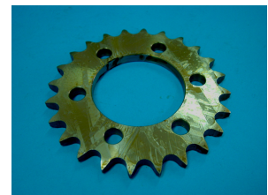
SPROCKET OD \varnothing 146.8 (N=29) HITACHI-CX