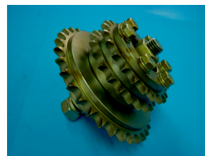
SPROCKET ASS'Y HITACHI V-EN H2214404