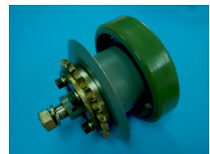
ROLLER ASS'Y HITACHI V-EN H2214405