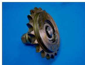
SPROCKET ASS'Y HITACHI H2214449