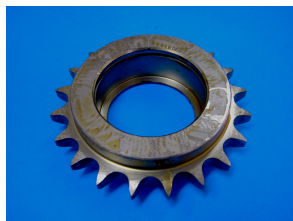
SPROCKET OD \varnothing 101.48 (N=20) HITACHI-CX

We also supply sprocket assembly sets and/or only sprocket for the escalator main driving and handrail driving unit. It's made from CNC machine tool.