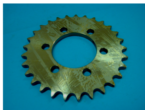
SPROCKET OD \varnothing 137 (N=32) HITACHI V-EN