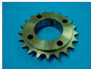
SPROCKET OD \varnothing 96 (N=22) HITACHI V-EN