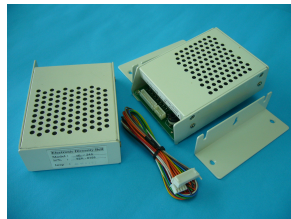
ELECTRONIC VOICE INPUT: DC 18-30V OUTPUT: 6 MESSAGES