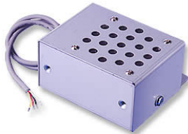
CH-2421-1 INPUT: DC 24V OUTPUT: 2 TONES