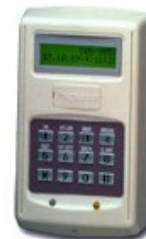
CARD READER FOR ELEVATOR MODEL: PP-3750 FOR 8, 16, 24, 32 OUTPUT