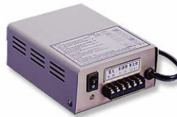
UP-2402-2 INPUT: AC 110-220V OUTPUT: DC 24V