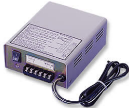
UP-604-2 INPUT: AC 110-220V OUTPUT: DC 6V

Power Supply for Intercom system, Electronic Chime, Voice Announcer, Bell, Card Reader, Alarm bell, Maintenance box GEN-2