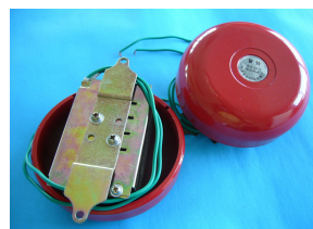
ALARM BELL 4" INPUT: DC 6V INPUT: DC 12V