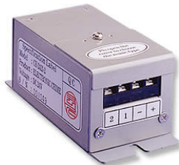
CH-2421-2 INPUT: DC 24V OUTPUT: 2 TONES