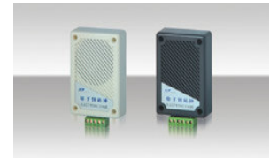
ELECTRONIC CHIME INPUT: DC 24V OUTPUT: 2 TONES