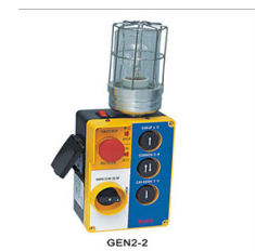
TOP CAR INSPECTION BOX OTIS GEN-2