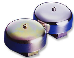
MAB-24-1 DC 24V MAB-110-1 AC 110V MAB-220-1 AC 220V