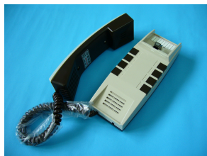
HANDPHONE TU1-8 FOR DUMBWAITER & CARGO LIFT