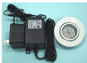
EMERGENCY LIGHT INPUT: AC 110-220V LED SUPER BRIGHT