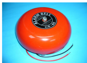
ALARM BELL 6" INPUT: DC 12V