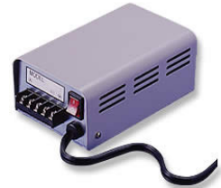
PS-10A FOR HANDPHONE TU1-8 FOR DUMBWAITER