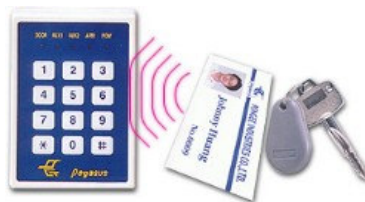
CARD READER FOR ELEVATOR MODEL: PP-5878 STAND-ALONE 1 OUTPUT