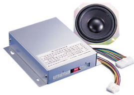
VOICE ANNOUNCER VM-12231-1 DC 24V ENGLISH/THAI MESSAGE