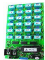
EXPANSION RELAY BOARD FOR CARD READER PP-3750