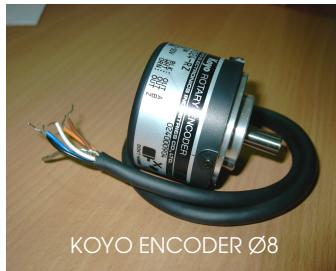
KOYO ENCODER Ø8