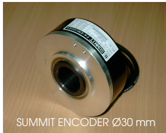
SUMMIT ENCODER Ø30 mm